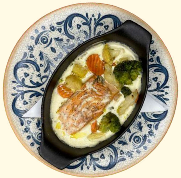
Baked salmon in sauce