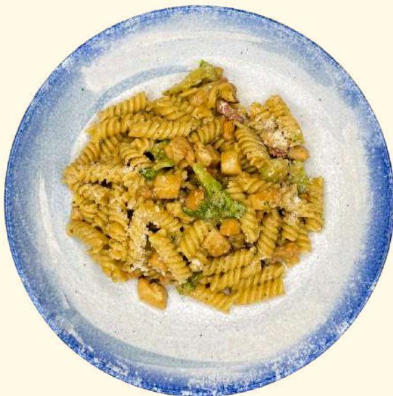
Fusilli with broccoli and chicken